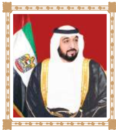
H.H. Sheikh Khalifa Bin Zayed Al Nahyan President of United Arab Emirates