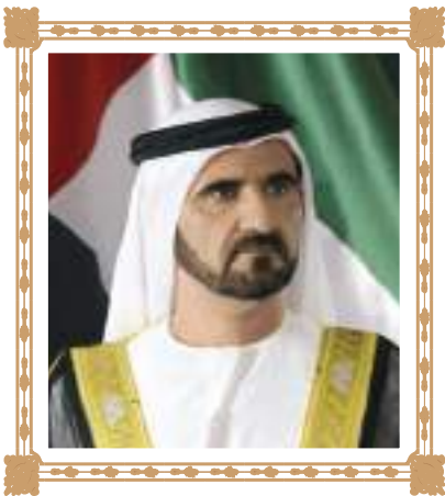
H.H. Sheikh Mohammed Bin Rashed Al Maktoum Vice President of UAE & Ruler of Dubai