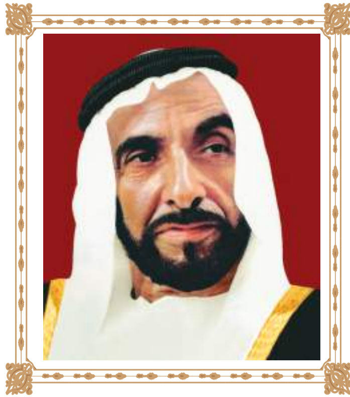
The Late H.H. Sheikh Zayed Bin Sultan Al Nahyan First President of United Arab Emirates