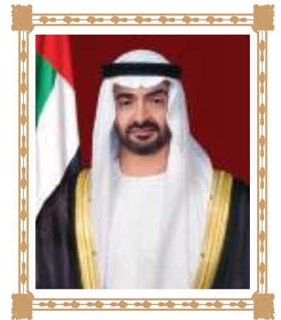
Lt. General Sheikh Mohammed Bin Zayed Al Nahyan Crown prince of Abu Dhabi and Deputy Commander of the UAE Armed Force